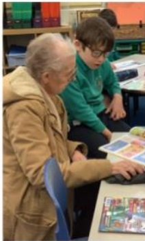
Red Class joined in with Reading Morning this week.