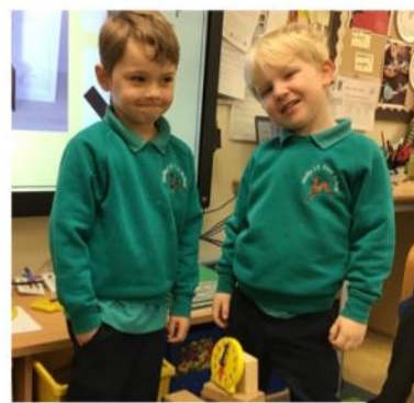
We are learning to tell the time in Red Class.