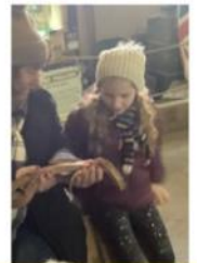
Yellow class loved holding the animals on our trip this week