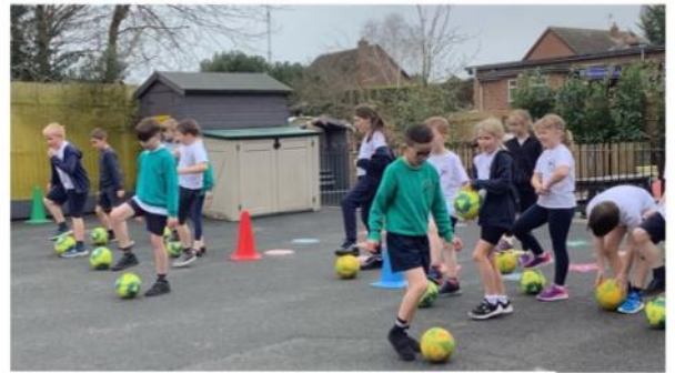
Orange Class trained hard with Kiddi Harriers this week.